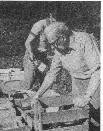
- Families of the Auckland, New Zealand, church collect and sort some of the 140,000 bottles they gathered in a $3,500-fund-raising effort June 18. The proceeds will help finance a future series of advertisements in New Zealand. (See "140,000 Bottles," this page.)