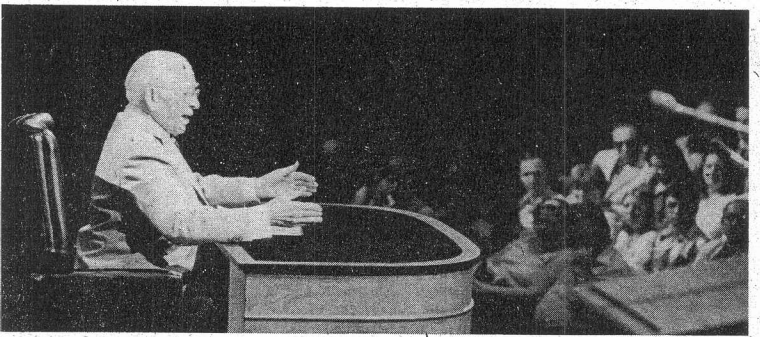
FEAST MESSAGES — Herbert W. Armstrong delivers two messages July 21 and 22 to be shown at all sites during the coming Feast of Tabernacles. The message recorded during the first part of the weekly Fridaynight Bible study will be shown at opening-night services at the Feast, and his full-length sermon the next day is scheduled to be shown at services on the first Holy Day during the Feast.